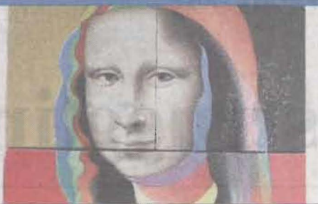
EXHIBIT AT FREEDOM TOWER QUESTIONS LONG-HELD BELIEFS, 1B