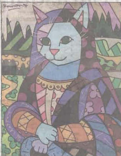
'MONA CAT': The acrylic on canvas was created by South Florida artist Romero Britto.

That's part of what makes Leonardo da Vinci's painting so interesting. Good art raises questions, an exhibit of art about the Mona Lisa multiplies those questions by 10. The painting is believed to have been completed in the beginning of the 16th century, and purported to be the portrait of the wife of a wealthy silk merchant, but that explanation, although widely accepted, is al-