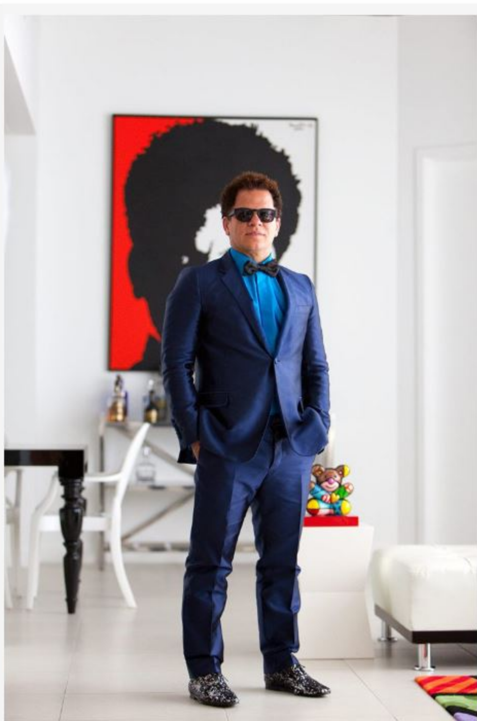
Humanitarian and International Pop Artist, Romero Britto

Warning: Invalid argument supplied for foreach() in /home/haute15/public_html/wp-content/themes/haute-living-2014/lib/rtp-custom-widgets.php on line 598 No pics found