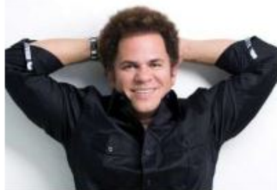
International Pop Artist, Romero Britto Takes Dallas