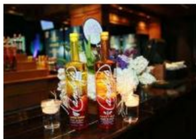
An Unforgettable Evening With Ally's Wish